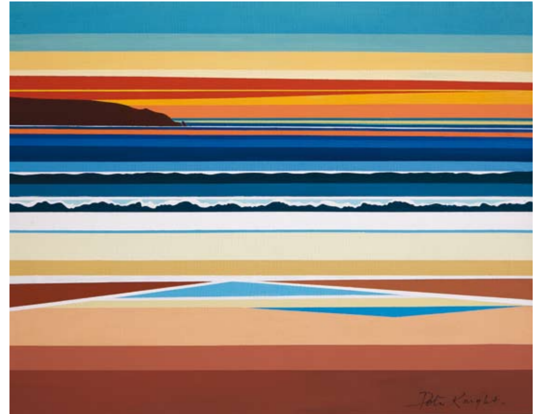
10 Jefferson Randles Lane to La Saie Slip, St Martin Mixed media 59.5" x 45"