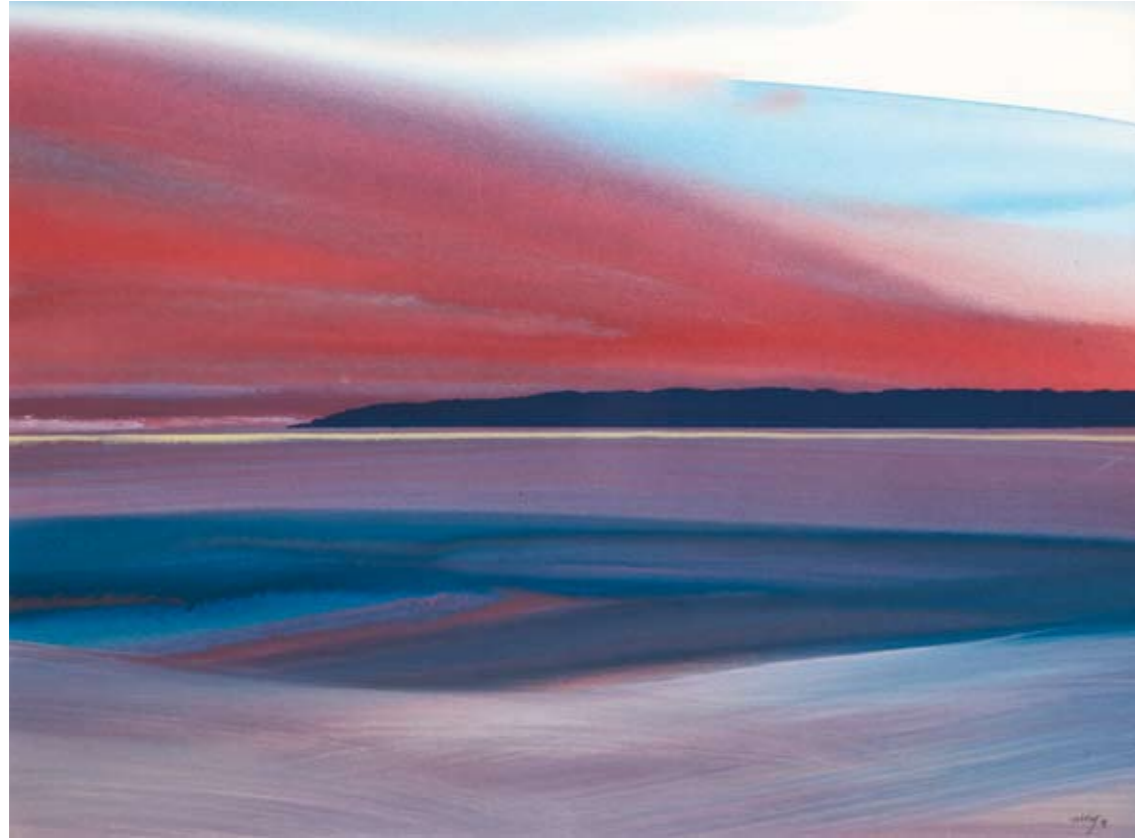
15 Robert Tilling MBE, RI. Grouville Bay Study Watercolour and Gouache on Paper 27" x 34"

This new work is from a series of studies for possible larger works on canvas. I am not interested in the detail but in atmosphere, colour and space. I am endeavouring to make this edge of the sea study as close to an abstract painting as I can without losing the sense of place.