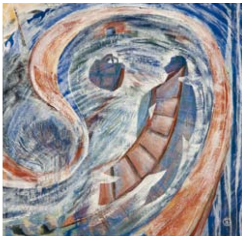
32 Sara Job ■ ■ Le Coleron Battery Oil on canvas 12" x 12"