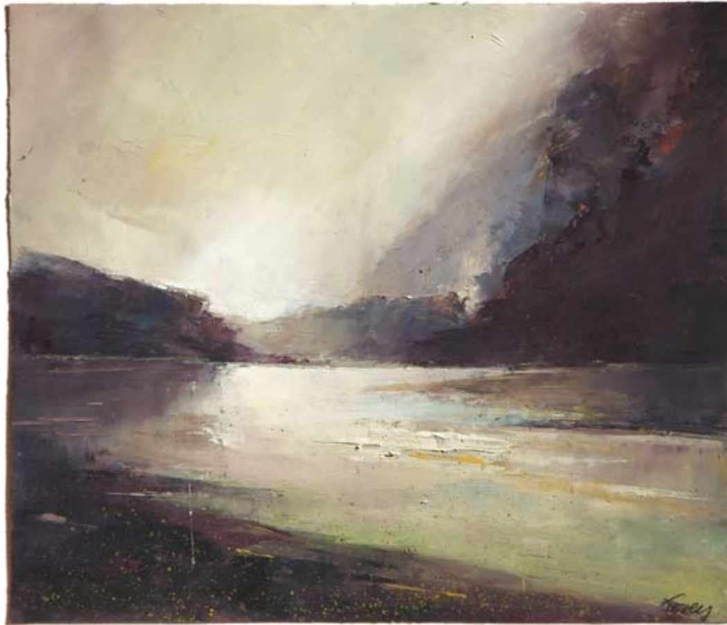
02 Graham Tovey Rock Pools Plémont Oil on paper 17" x 17"

Nature plays an important part in my life. Time spent watching birds in their natural habitat around the coastline of Jersey. The rich diversity of this landscape is what inspires me to paint.